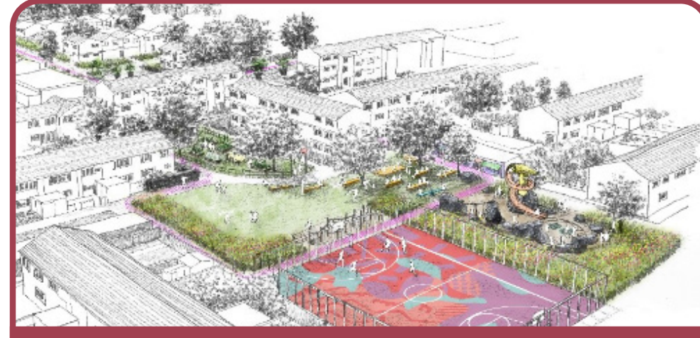
Ou vision for Central Area Green