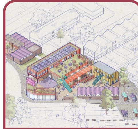
Our vision for the TMO Office