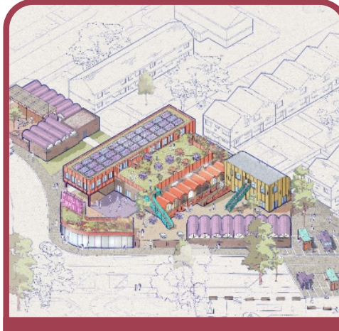
Our vision for the TMO Office