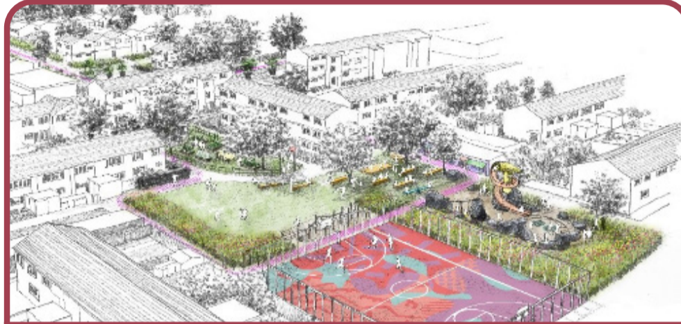
Our vision for Central Area Green