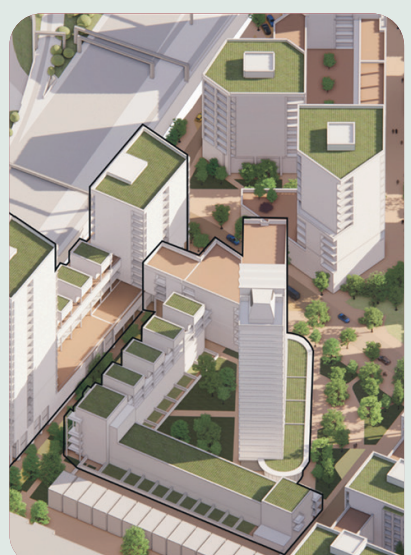
View of Lund Quarter

As well as a series of meanwhile projects to enliven the estate for the benefit of existing residents and the wider community in Stratford and beyond. This much anticipated approval will pave the way for the next phases of work to commence.